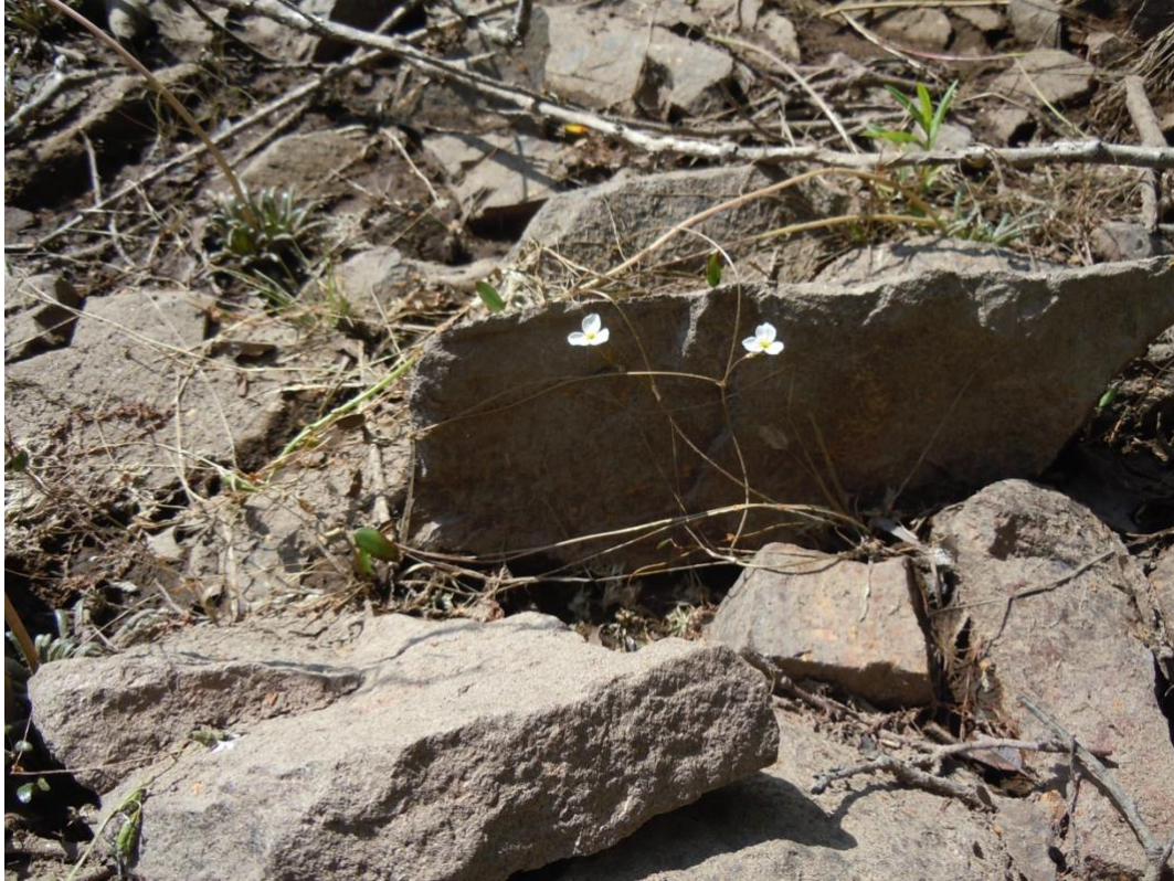
Photo 15. Existing flowers persist after plants emerging exceptionally well for a long time. 3.08.2019.