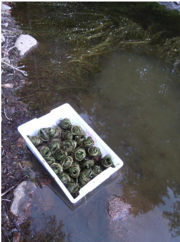
Photo 9. Big clumps collected with 40cm lower water level. Breisjøen, location 2. 8.08.2019.