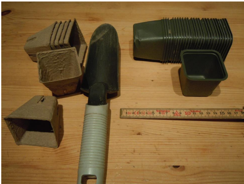
Photo 4. Biodegradable pots and spatula used for Luronium transplantation.

Usually in one pot was one Luronium rosette with some daughter rosettes on stolons, sometimes few other rosettes. I count one pot as one individual.