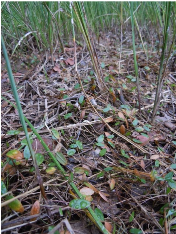
Photo 18. Cluster of young seedlings of Luronium . 5.08.2019