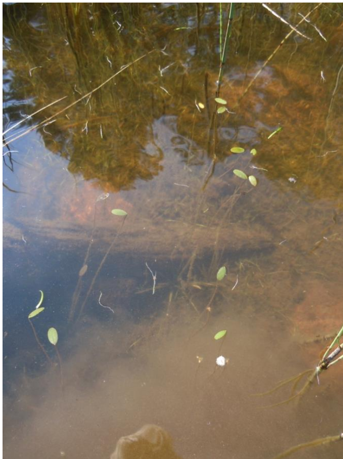
Photo 12. Only plants growing to a depth of ca. 20 cm scarce produce floating leaves and flowers. 26.07.2019.

Existing flowers persist after plants emerging exceptionally well for a long time. Photo 15.