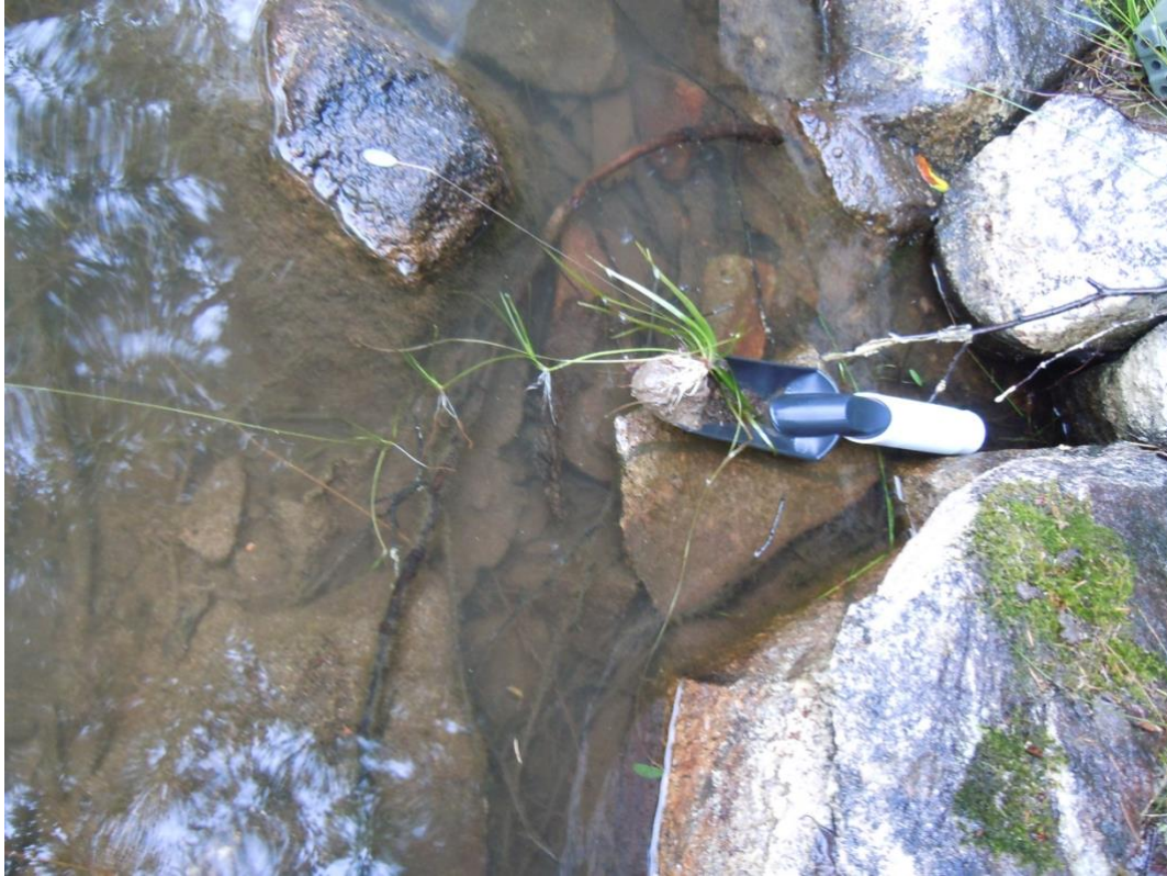
Photo 5. Planted in pots single Luronium rosette with daughter plants on stolons. 19.07.2019.