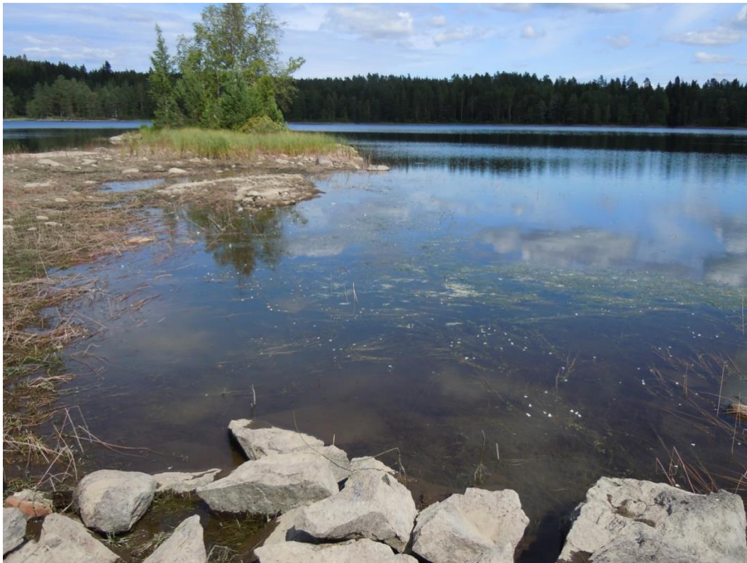
Photo 3. Breisjøen, location 3, with 40 cm lower water. 1.08.2019.