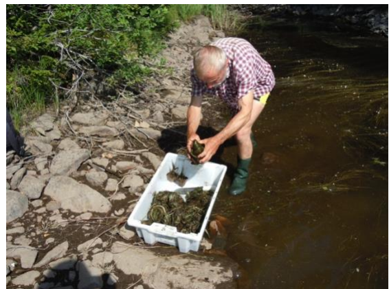
Photo 7. Collecting clumps from location 2. Breisjøen. 3.08.2019.

10 to 30 plants (stem rosettes together with young ones) were found in large clumps harvested in this way.