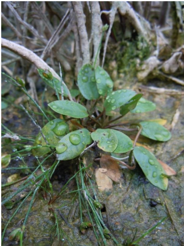
Photo 16. If the substrate is continuously wet Luronium can live as a terrestrial form.