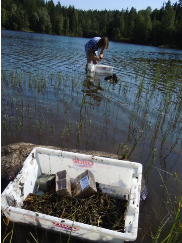
Photo 8. Collecting ca. single plants to paper pots. Breisjøen, location 3. 26.07.2019.