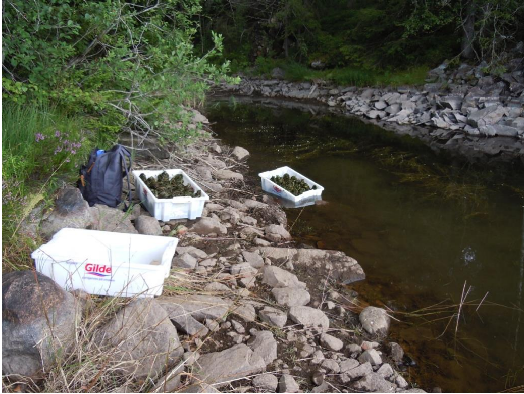
Photo 2. Breisjøen, location 2, with 40 cm lower water. With such a lowered water level, it was possible to dig large clumps from the loamy bottom with plants rooted in them. 8.08.2019