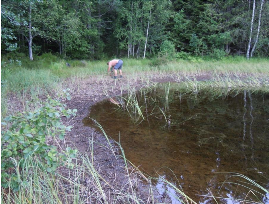
Photo 17. An accumulation zone of organic matter on the shore of Breisjøen. 5.08.2019.

On the shore of a shallow bay, in the western part of Breisjøen, in the accumulation area of organic matter pushed from the lake surface by waves and wind, considerable clusters of small rosettes with land leaves were found. Probably they are clusters of plants germinating from seeds that abundantly grew last summer.