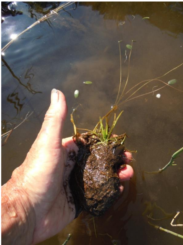
Photo 6. Planted in pots small clump with more than one rosette, daughter plants and floating leaves on long petioles. 26.07.2019.