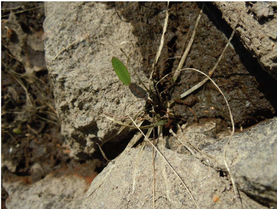
Photo 14. After emersion, delicate underwater leaves die and the plant produces land leaves on short stiff petioles. 3.08.2019.