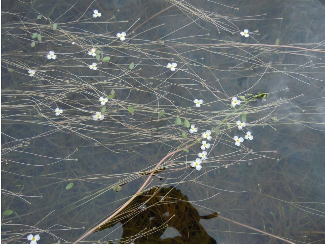
Photo 13. Luxuriantly grown floating leaves and flowers with shoots lying on the lowered water surface. 31.07.2019.