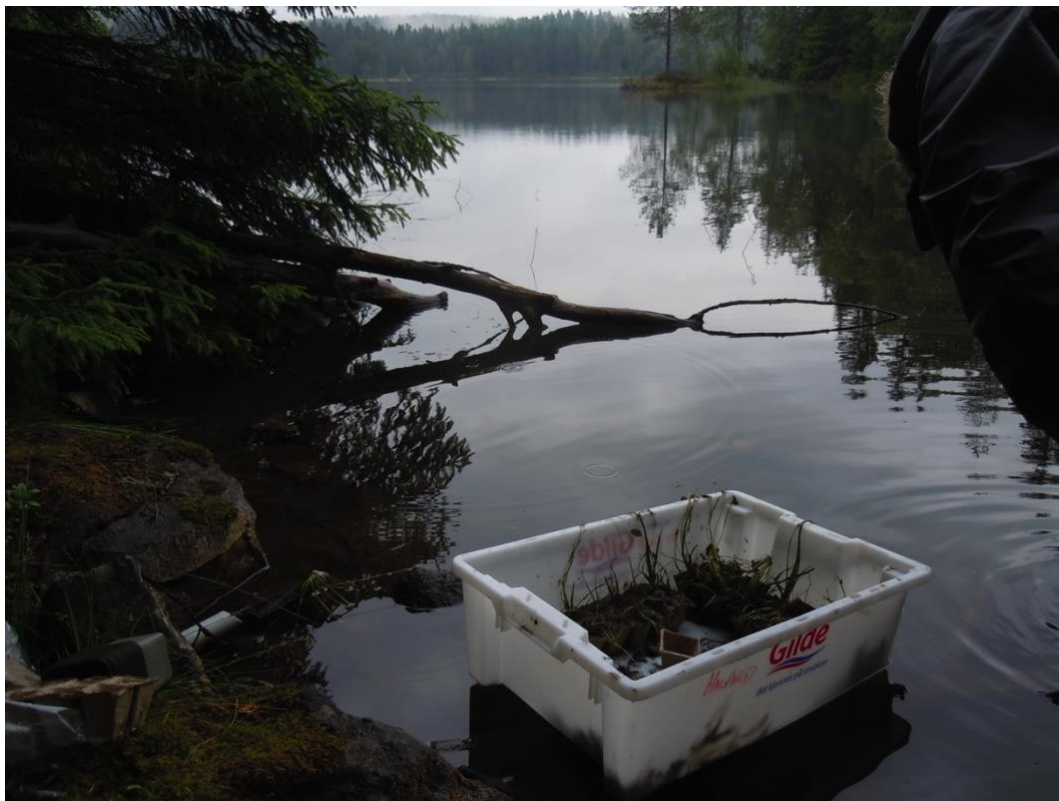
Photo 1. Breisjøen, location 1, with the maximum water level. Start of work. Attempts were made to dig individual plants into biodegradable paper pots. 19.07.2019.

Attempts were made to dig up individual plants along with as many as possible clay and organic deposits they were rooted in. After taking from the water they were planted in small biodegradable pots and placed in transport boxes.