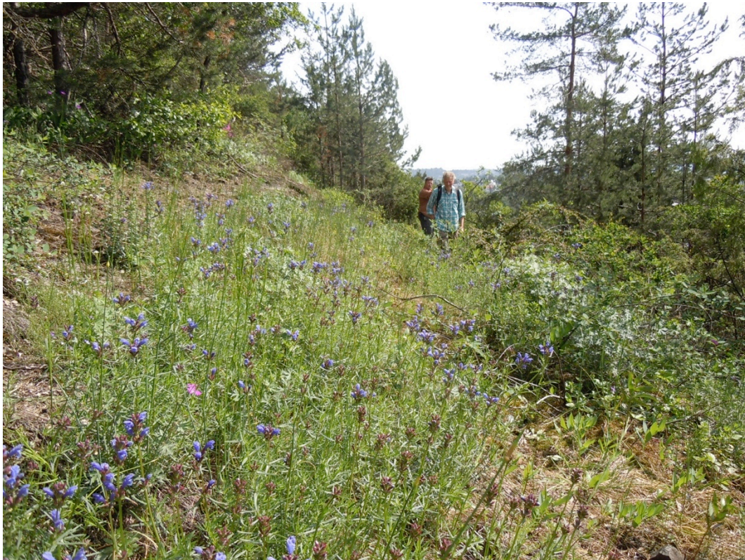
Photo 1. Ekeberg 2 (B) – Jomfrubråten. Plants already start blooming on dry sunny places. 4.06.2019.

Generally, it was a good year for Dracocephalum - the plants developed well and bloomed quite abundantly early, from the beginning of June.