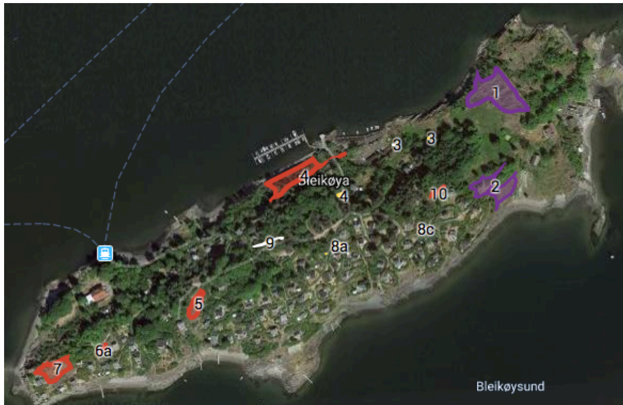
Map 1. Localities on Bleikøya.

8 of 10 localities at Bleikøya were in good condition. Plants were blooming abundantly in the first half of June. Only at location 3 (usually with only a few individuals) no Dracocephalum individuals were found and at location 6 there was much less Dracocephalum than in previous years.