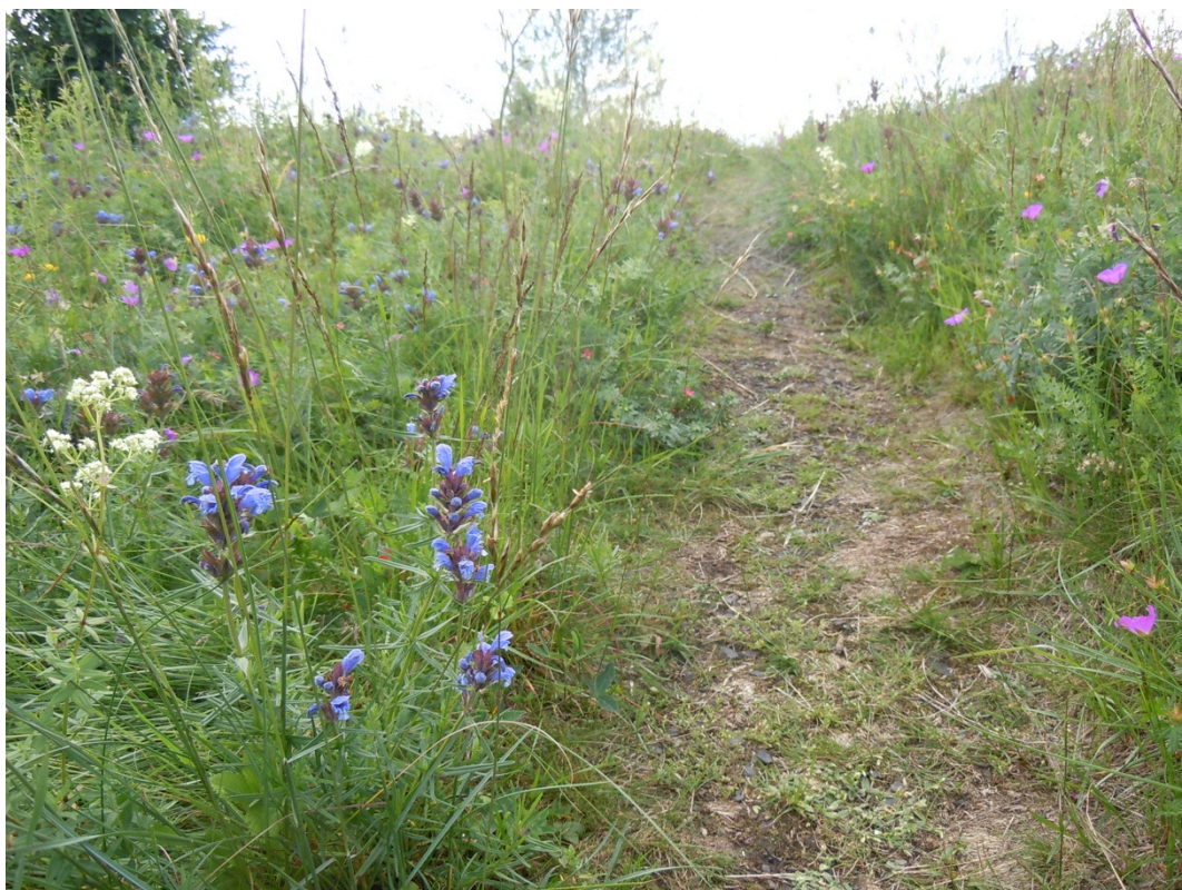
Photo 2. End of quite abundant blooming on main location on Heggholmen. 22.06.2019.