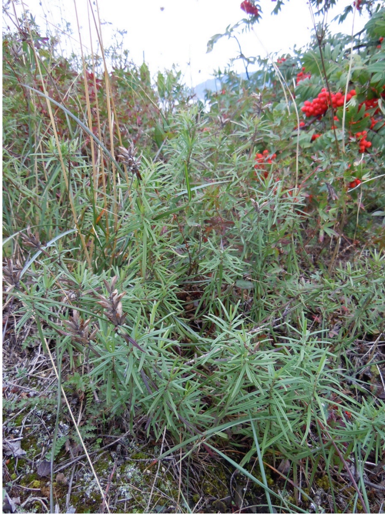
Photo 3. Dracocephalum plants, new localion 3 on Heggholmen Hill. 28.08.2019.