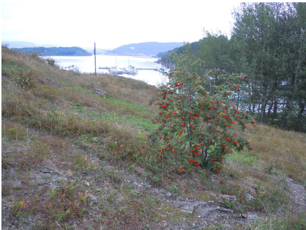
Photo 2. New location 3, on Hegholmen Hill. 28.08.2019.