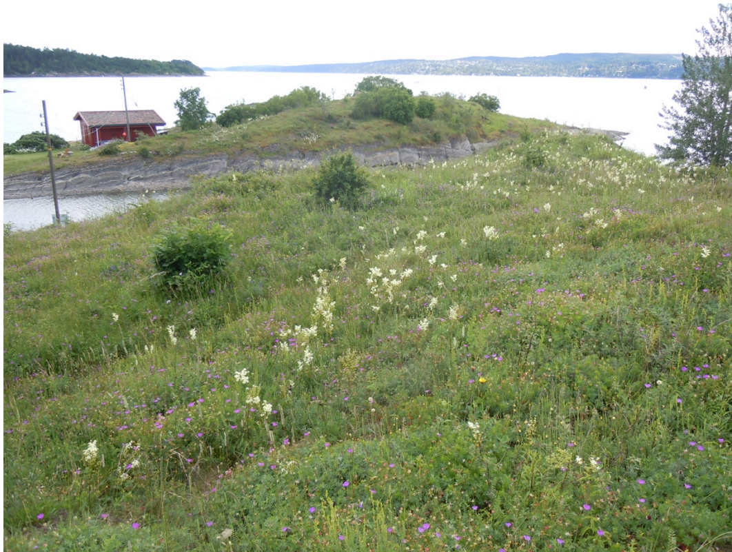
Photo 1. Main ( known ) location in Heggholmen. 22.06.2019.