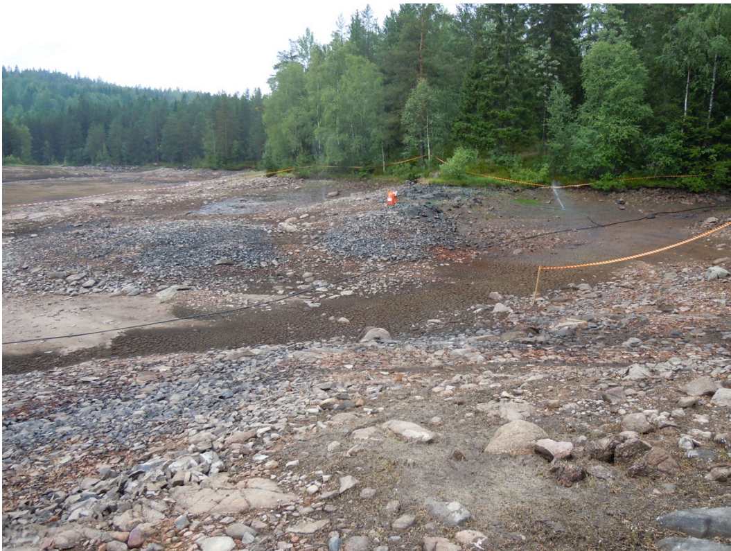
Photo 2. No 3 (red) Irrigation of the small bay and the slope of the bottom in the eastern part of the lake.