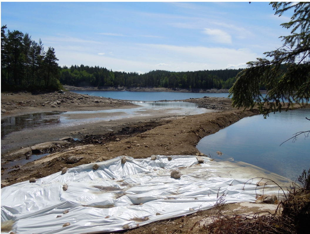
Photo 4. No 2 (blue) Dam (on right), “our dam” no 3 and wet area no 3+ (center), No 4 (red) Irrigation (left) in the northern part of the lake.