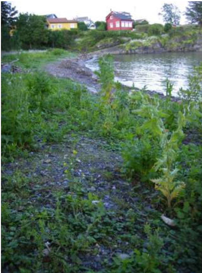
Phot.2. Another concentration of Hyoscyamus in a central part of a beach. 18.06.2011