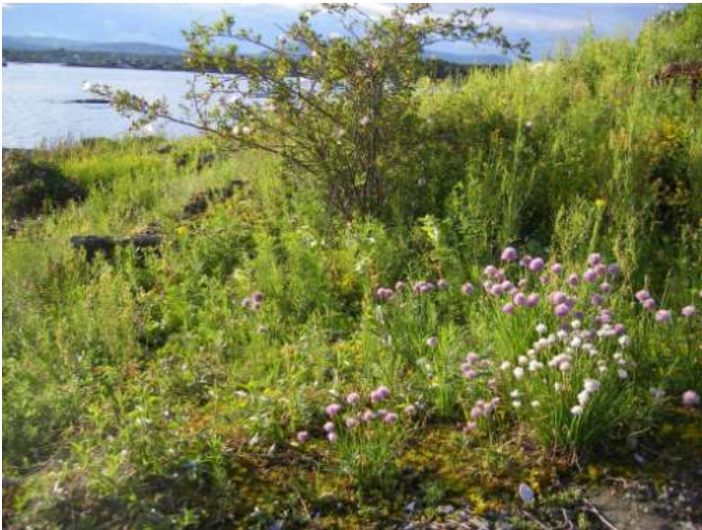
Phot.2. Hyoscyamus plants in SW part of Jakteskjer. 20.06.2011