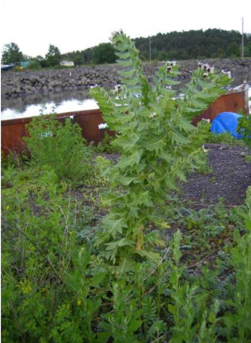
Phot.1. One big plant close to boat wreck. 20.06.2011