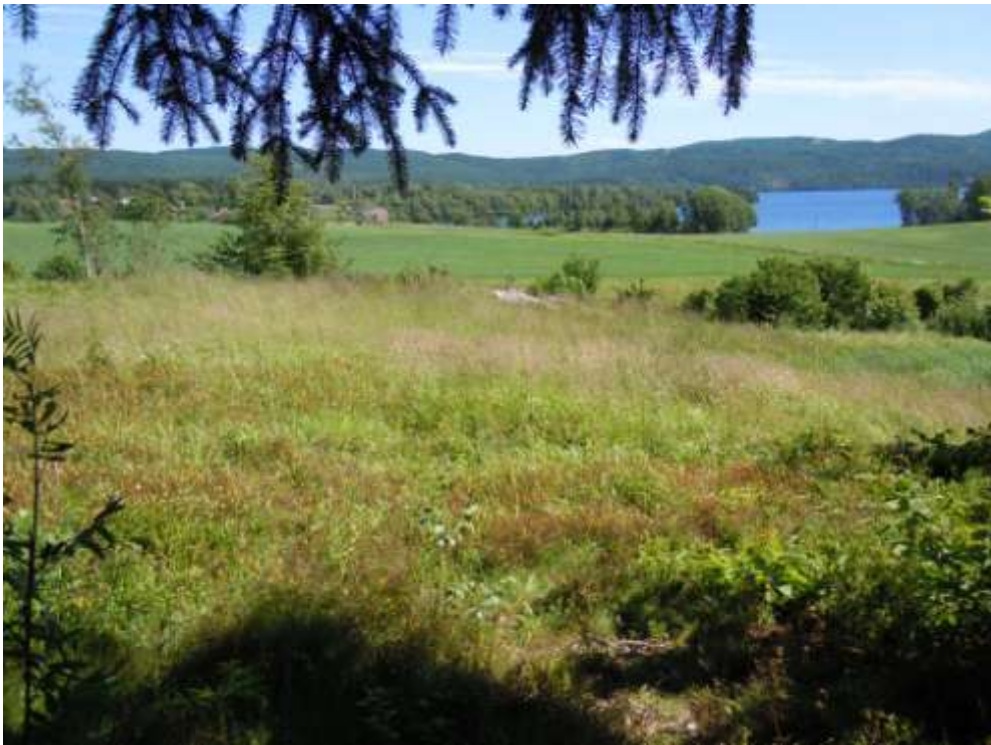
Phot.2. Pyrola media plants in full blossom on the location “1”. 29.06.2011