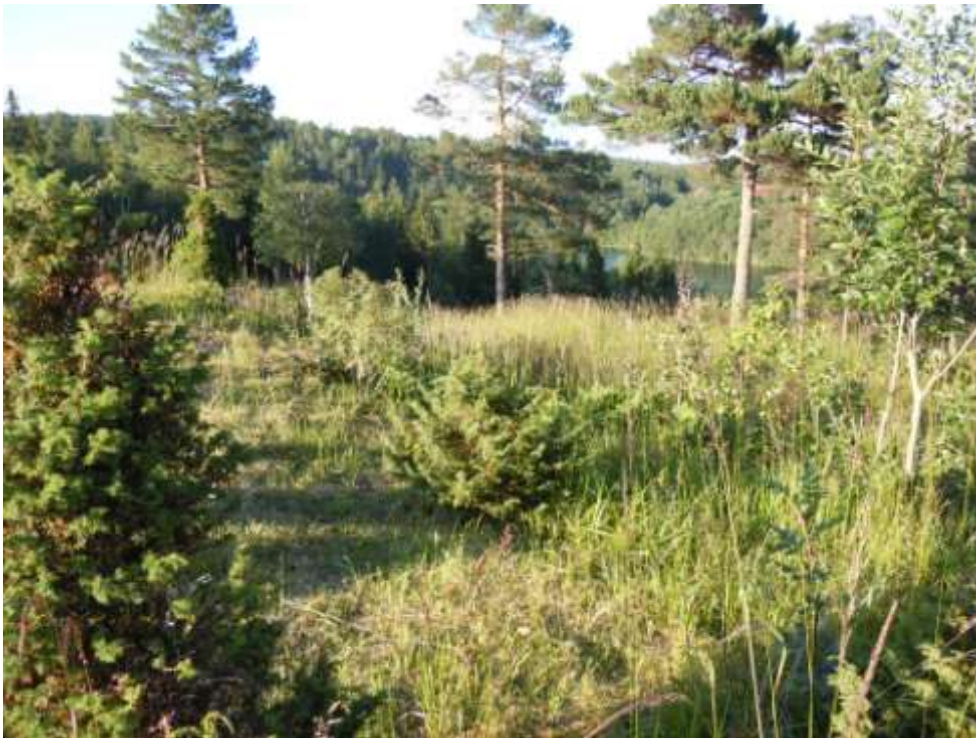
Phot.2. Concentration of Pyrola media close to resting place with flag mast. 16.07.2011