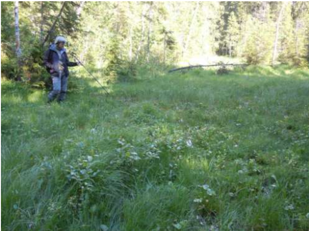
Phot.2. Lowest part of a mire with concentration of Microstylis . 2.07.2012