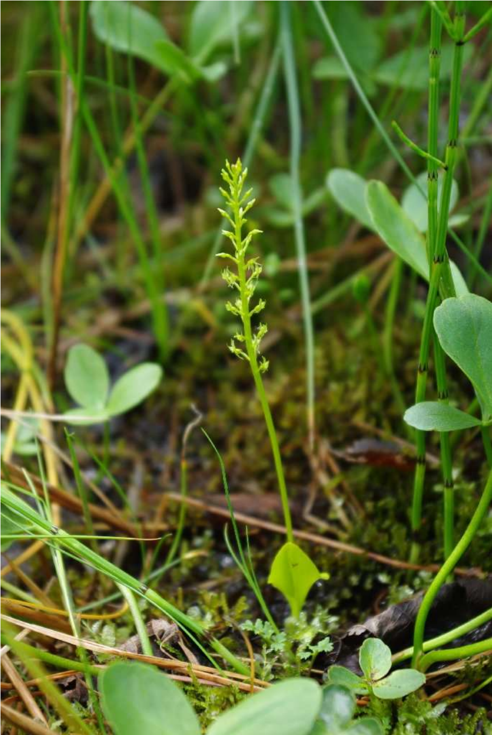
Phot.1. Blooming individual on location 1.2. 2.07.2012