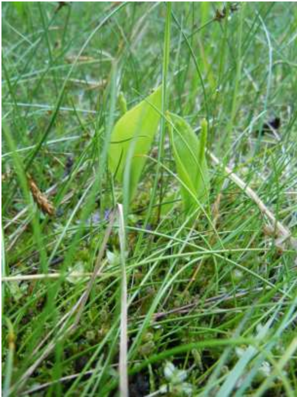
Phot.2. Ski trail in a middle of mire with a last year found individual. 2.07.2012