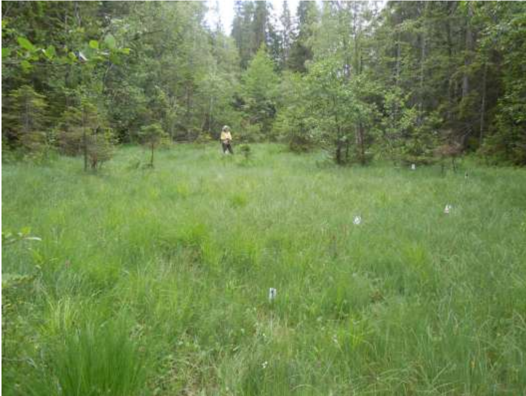
Phot.2. Blooming individuals are very small 3 -5 cm. 4.07.2012