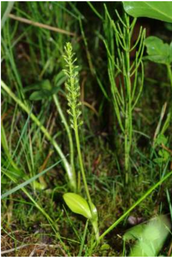
Phot. 4. The most robust individual on Holbekken mire. 2.07.2012