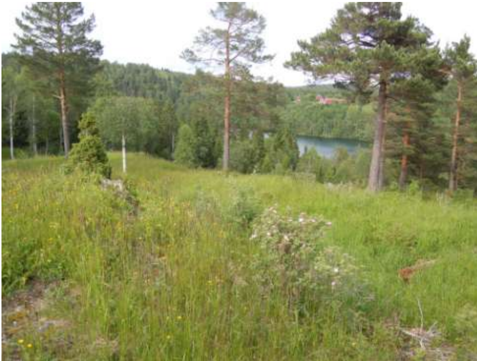
Phot.2. Most of Pyrola media just begin to be in bloom. 3.07.2012