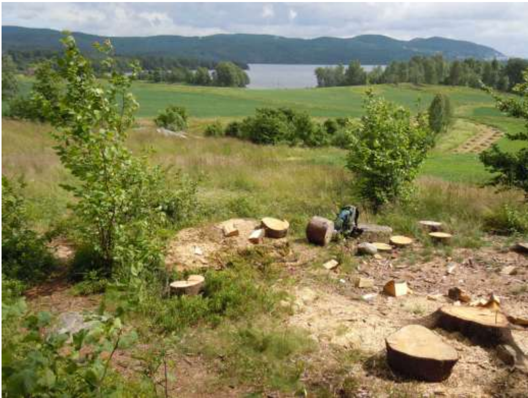
Phot.2. Location of Pyrola media was completely trampled. 2.07.2012