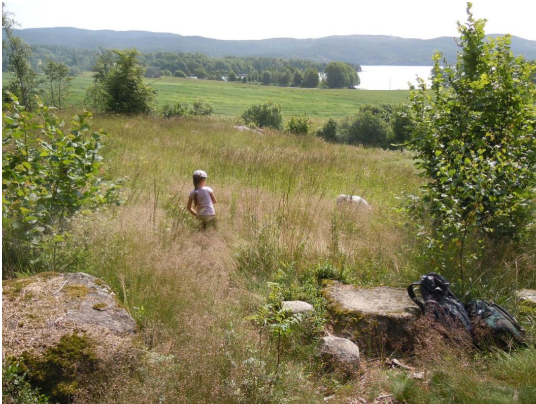
Phot.2. Blooming plants are quite big (20 cm). 8.07.2013