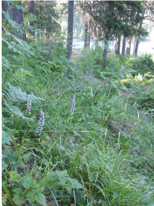
Phot.2. Flowering specimens within herbaceous vegetation. 8.07.2013