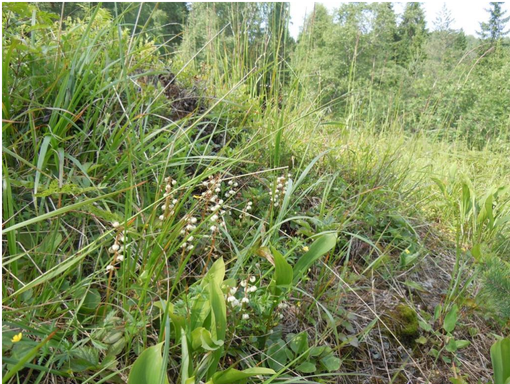
Phot.2. Pyrola chlorantha also occur in that location. We found a total of 11 flowering specimens in 2 concentrations. 8.07.2013