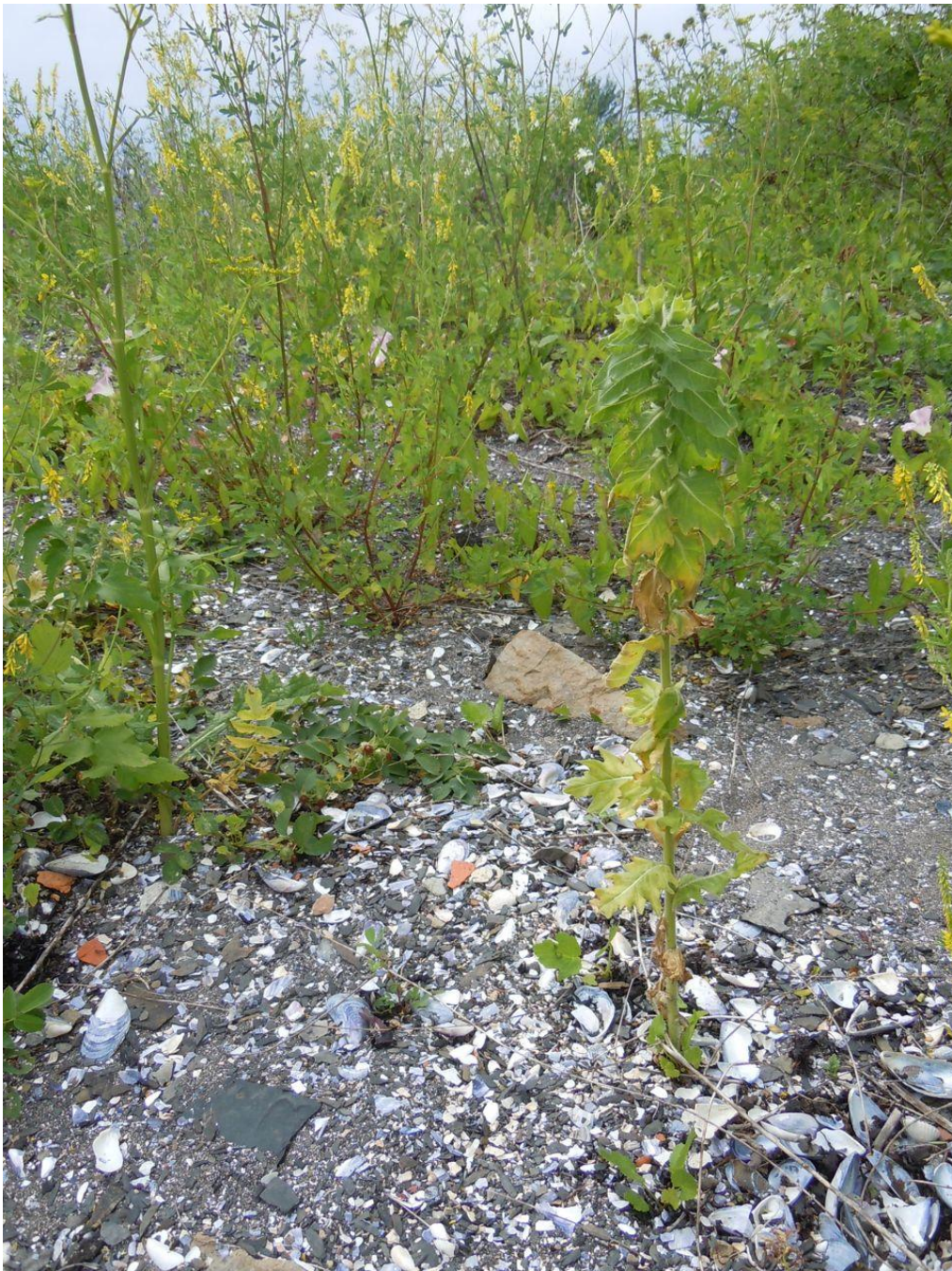
Phot.1. Hyoscyamus niger on the location 1, close to Jakteskjer. 9.07.2013