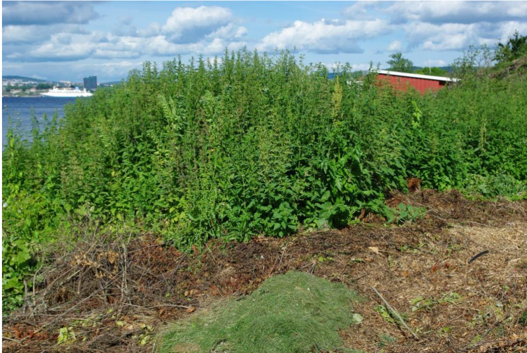
Phot.2. Blooming specimen. 1.07.2013