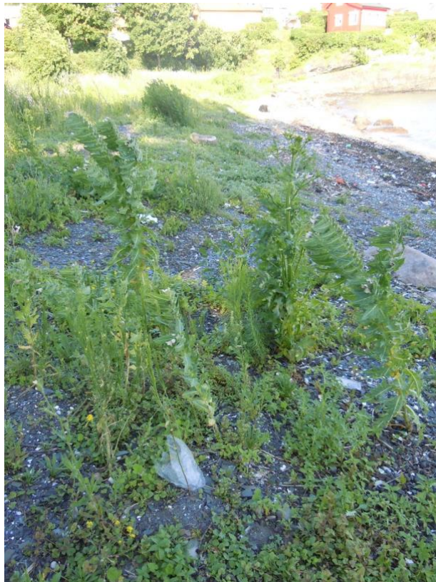
Phot.2. Central part of a beach, view from the East side. 1.07.2013