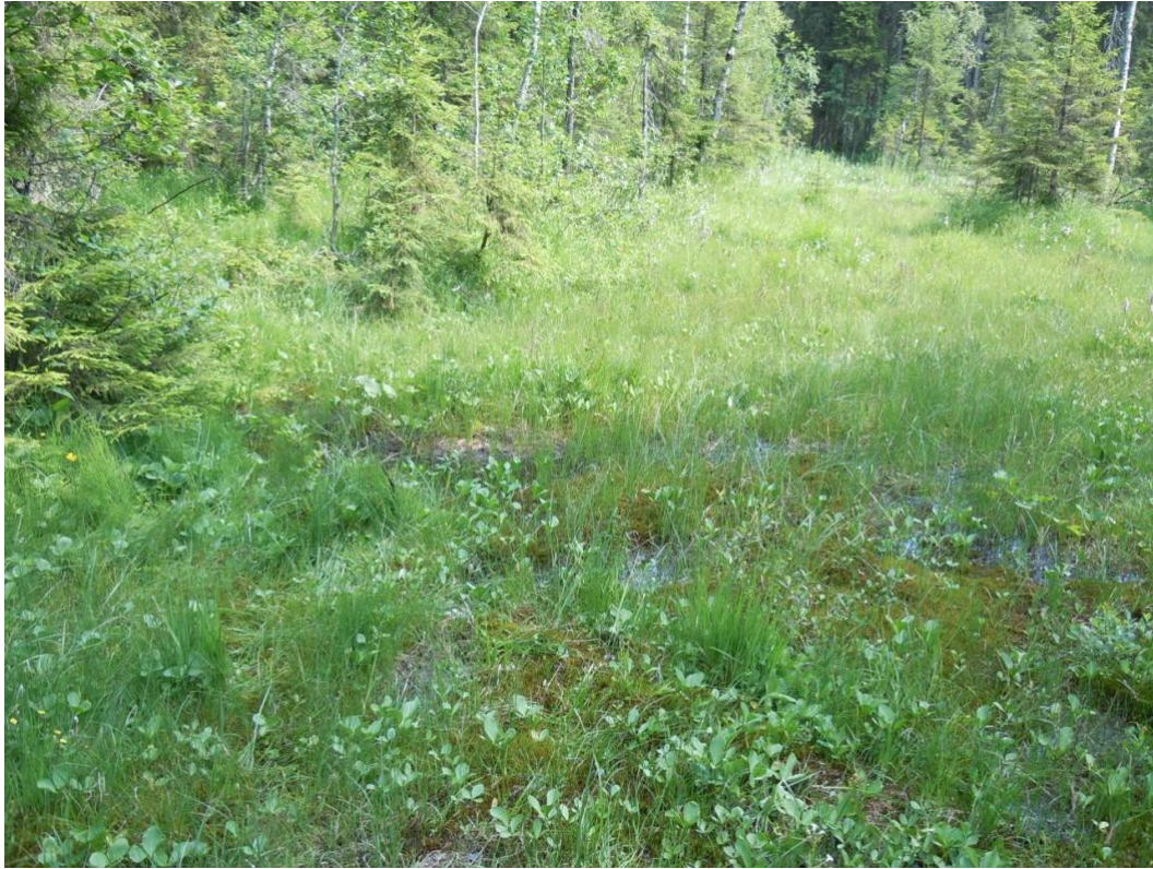
Phot.2. Central part of mire with 3 blooming plants. 12.07.2013