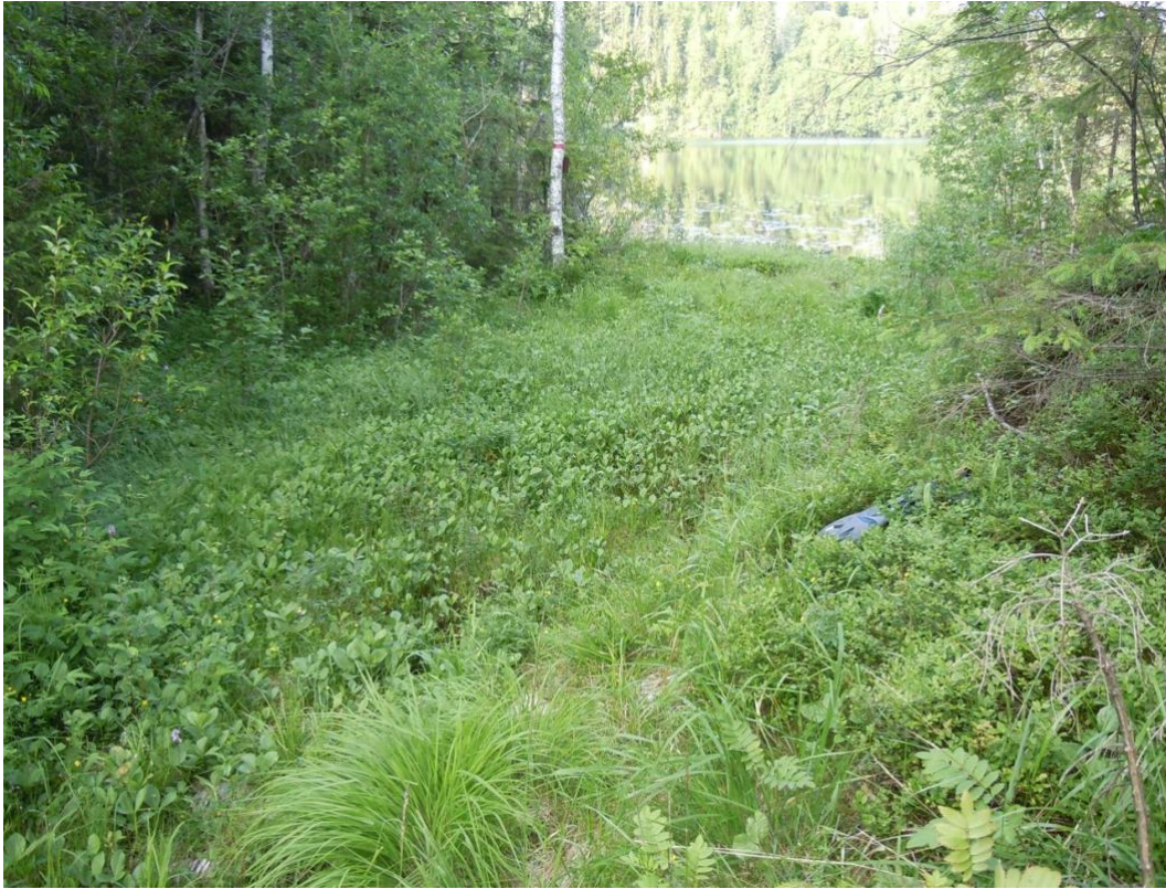
Phot.2. 1 blooming and 1 vegetative individual. 11.07.2013