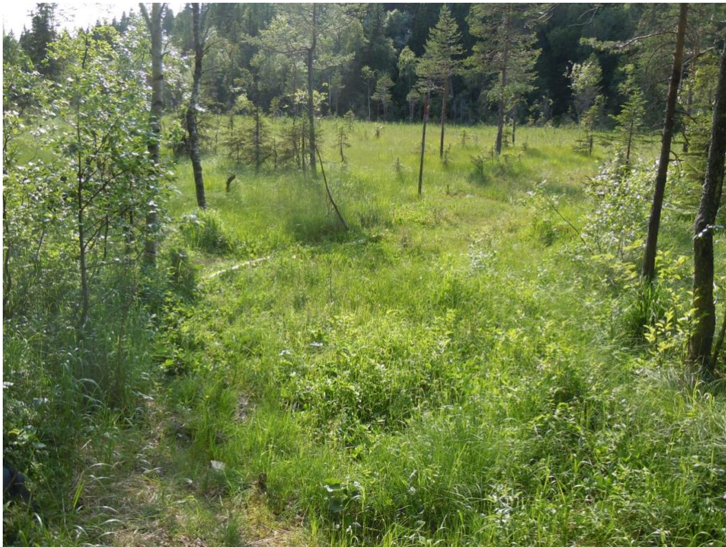
Phot.2. Blooming Microstylis in the middle of ski trail. 11.07.2013