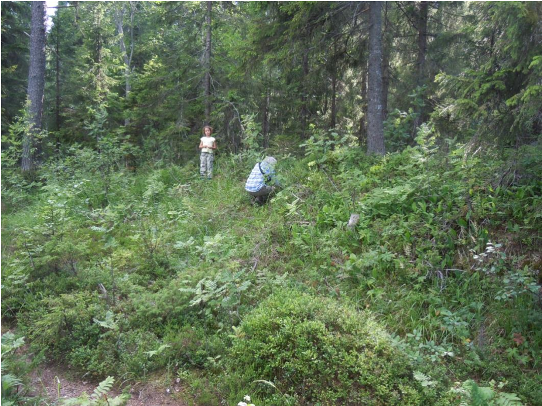
Phot.2. End of blooming at the time of observation. 10.07.2014.