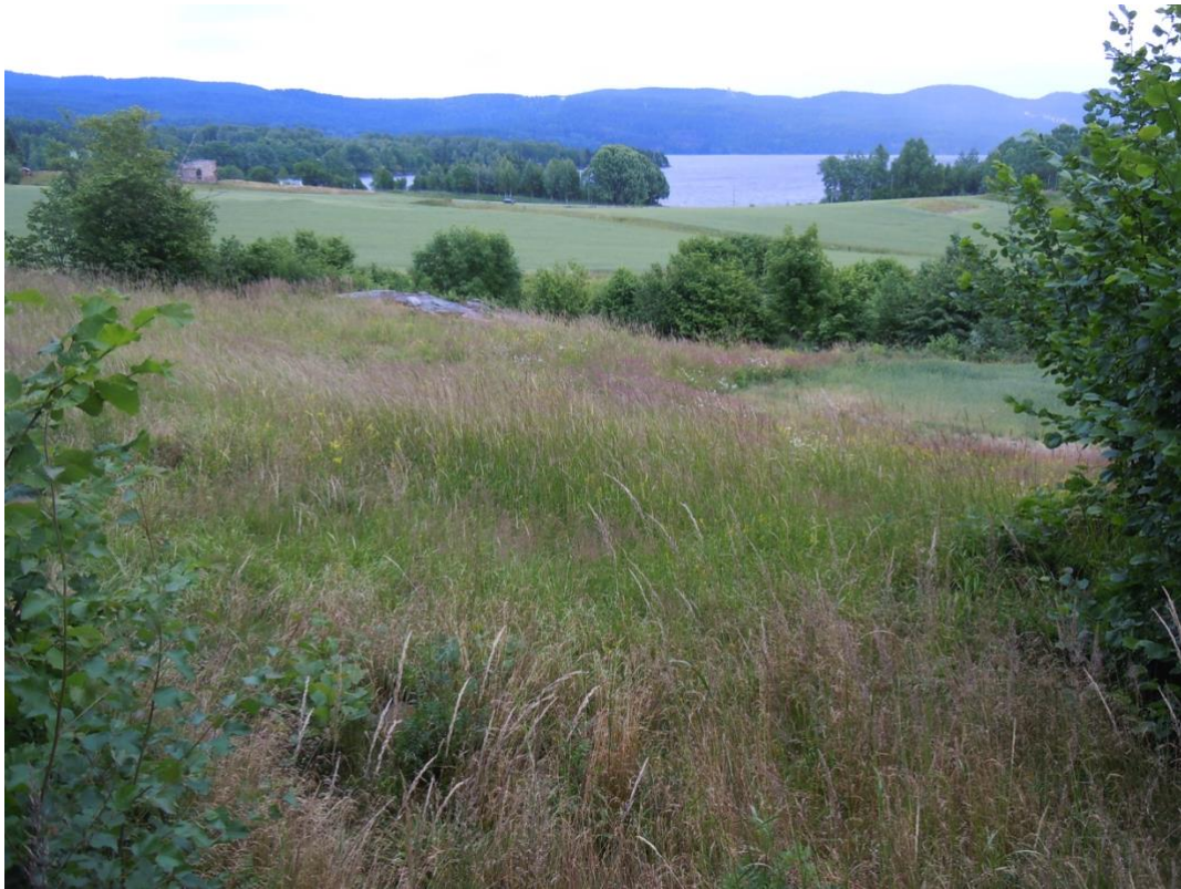
Phot.2. Few vegetative rosettes. 9.07.2014