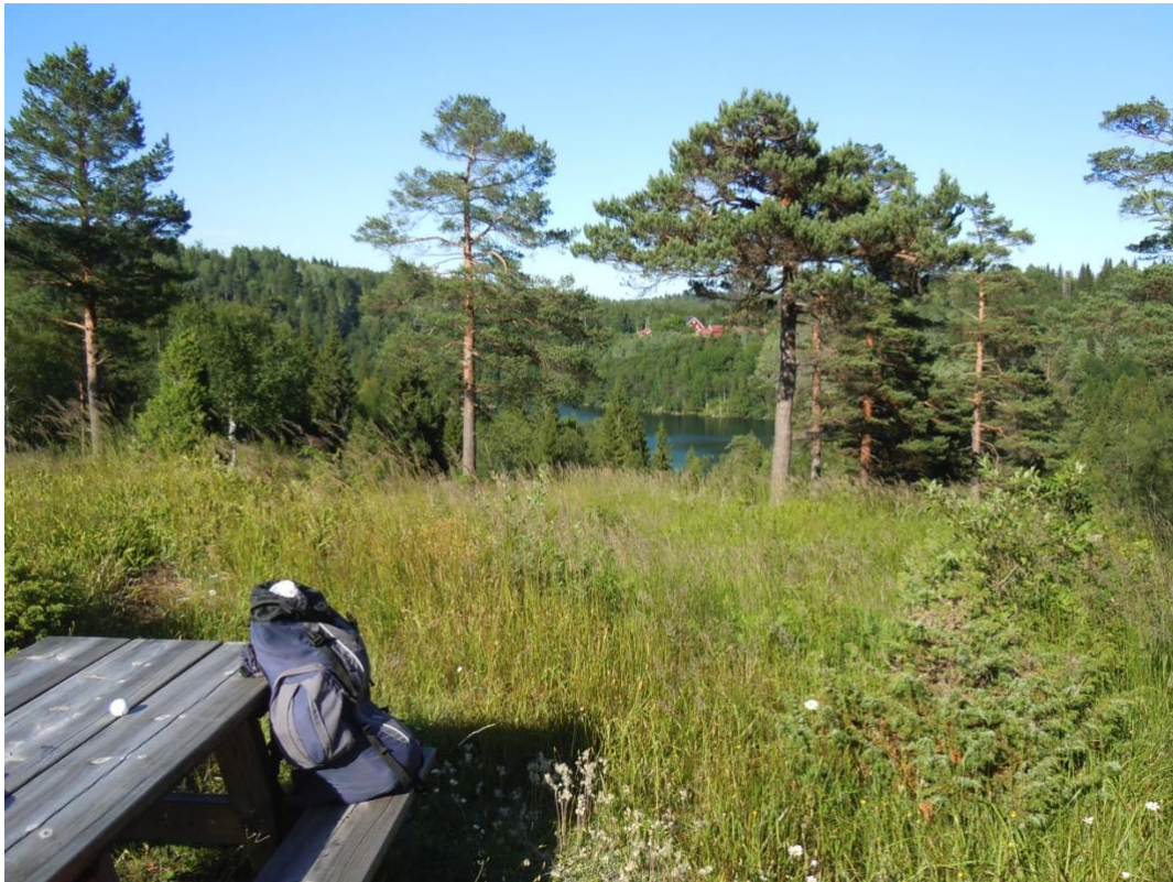
Phot.2. Most of Pyrola media plants already finish blooming. 12.07.2014.