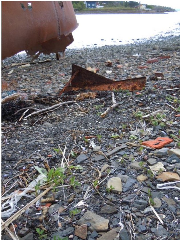
Photo 2. Vegetative plants on site close to wreck. 19.06.2015