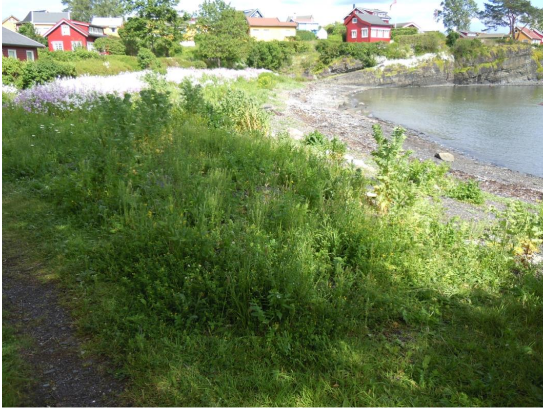
Photo 1. View over location Nakkholmen 2. 20.06.2015.