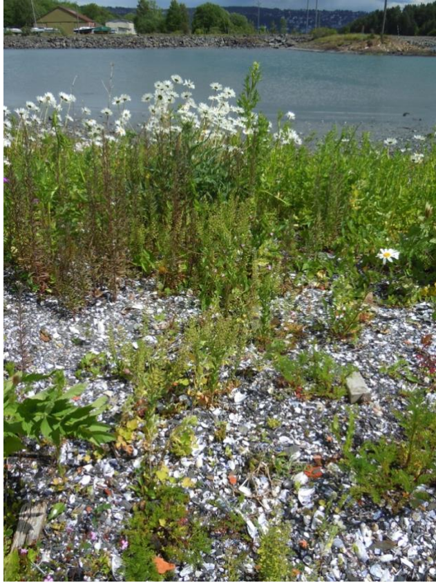
Photo 1. Few small blooming plants on site close to Jakteskjær. 19.06.2015.