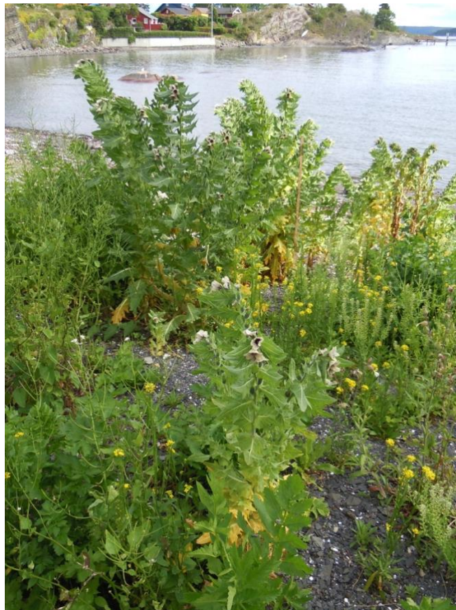
Phot.2. Western part of a beach with blooming Hyoscyamus plants. 20.06.2015.