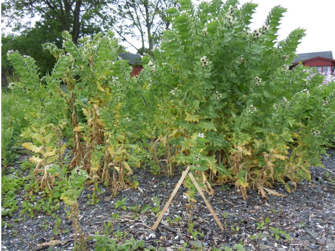
Photo 3. Some of the biggest plants. 20.06.2015.