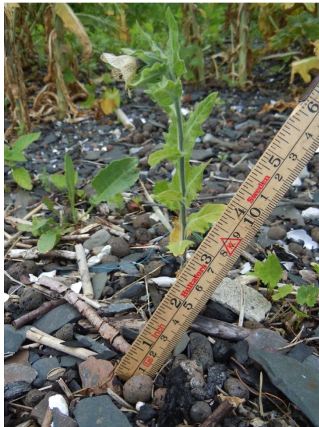
Photo 4. ...and one of the smallest. 20.06.2015.