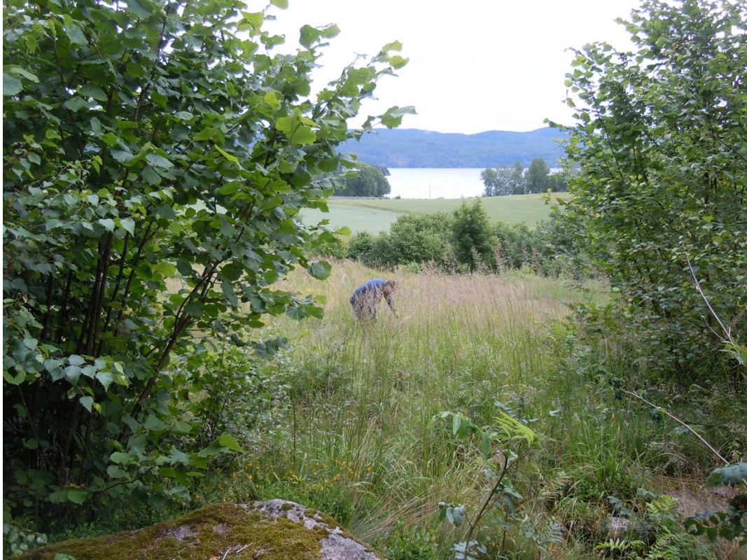
Photo 1. This Pyrola location is too much overgrown by toll grass. 10.07.2016.