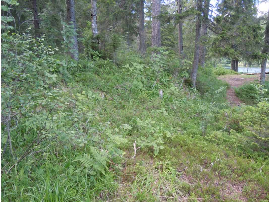
Photo 1. A View over location 1.2 close to Blankvann. 4.07.2016.