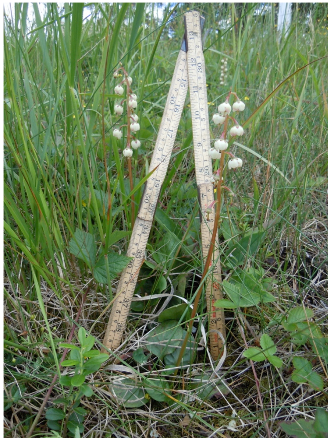
Photo 2. Very large and splendid Pyrola media plants in full blooming. 3.07.2016.