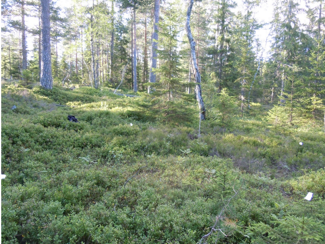
Photo 1. Location Motjernet, smaller concentration of Pyrola media . On a marked area 6 blooming/ 143 vegetative individuals have been counted. 9.07.2016.