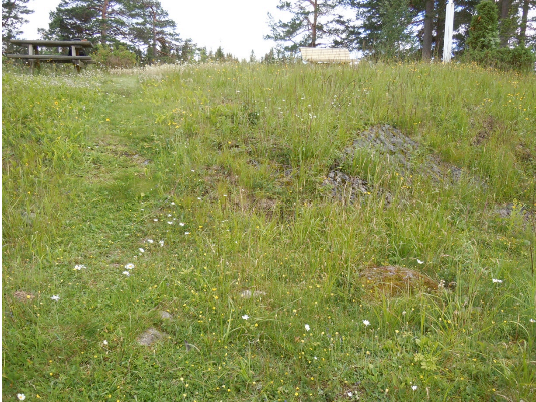
Photo 1. Location Blankvann 1.1. Pyrola media concentration on the top of a hill. 3.07.2016.