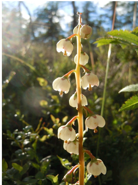
Photo 2. Pyrola media in full blooming period, plants were large and splendid. 9.07.2016.