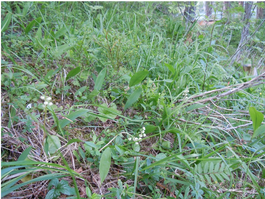
Photo 2. Only few blooming plants. 4.07.2016.