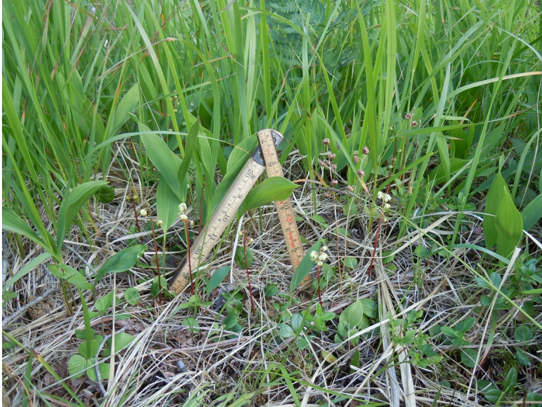
Phot.3. Only 1 concentration with Pyrola chlorantha has been found this year and plants are smaller than last year. Visible last year dry shoots. 3.07.2016.