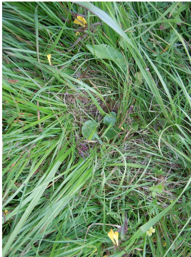
Photo 2. A few vegetative rosettes could be found after spreading out dense vegetation. 10.07.2016.