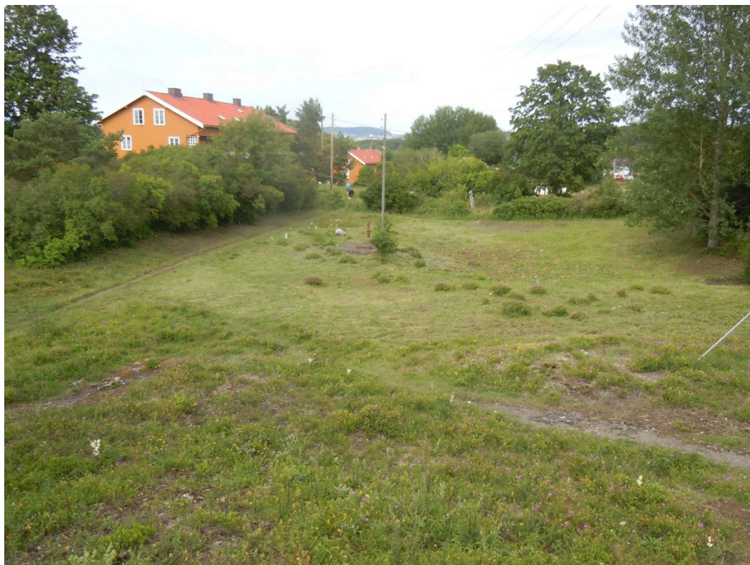
Photo 2. ... and after mowing. 21.06.2022.