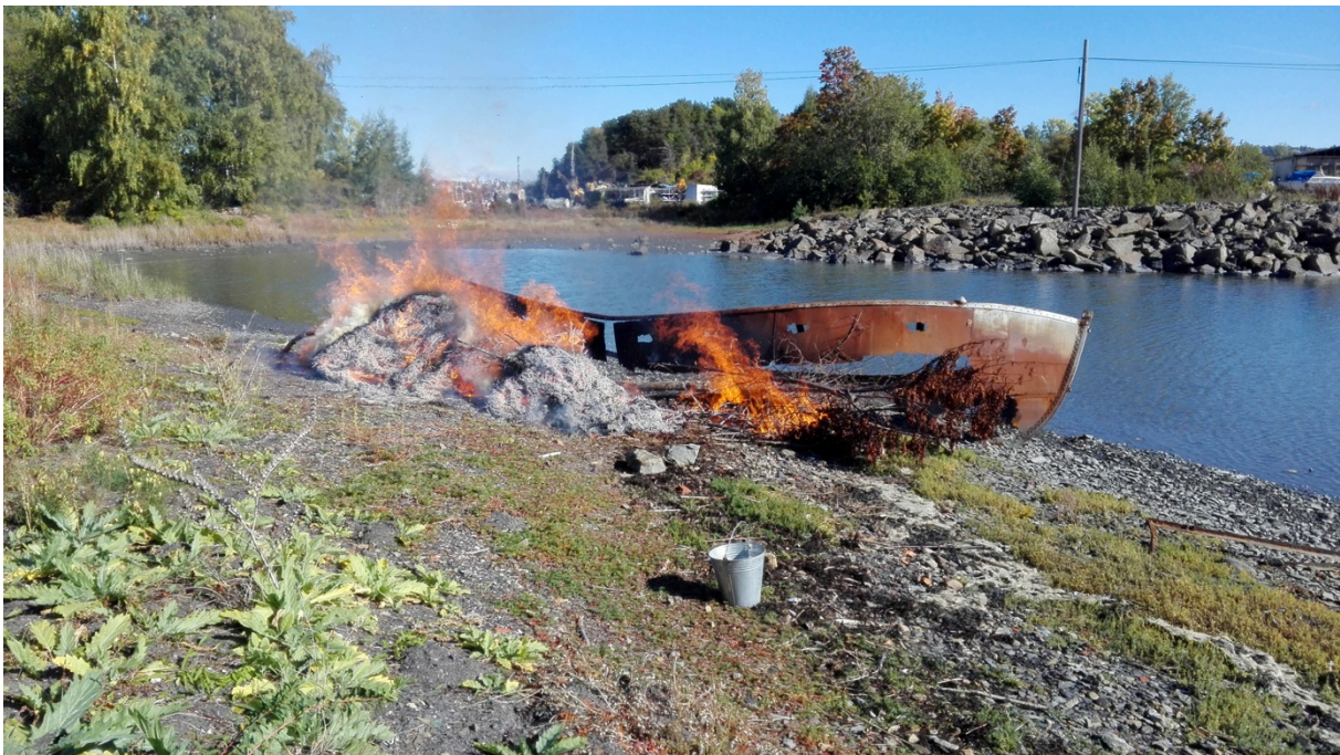
Photo 14. Burning a haystack. This is where Bulmeurt Hyoscyamus niger grows abundantly in some years. This year, you could see many first-year vegetative rosettes (left side of the photo). 20.09.2022.