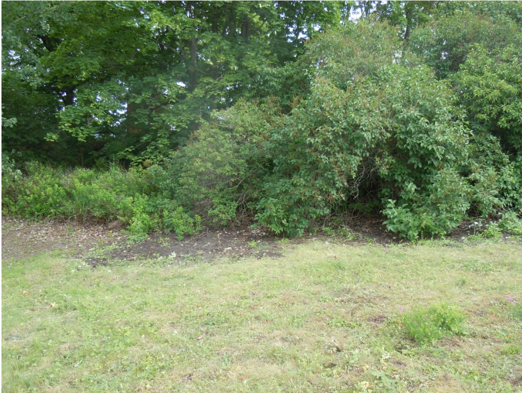
Photo 5. Clusters of Bergenia were removed by roots. 21.06.2022.