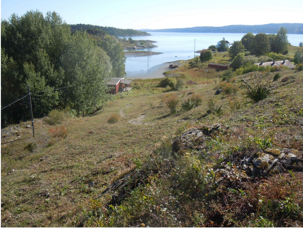
Photo 11. Main mowing at Heggholmen Hill has been done... 1.09.2022.