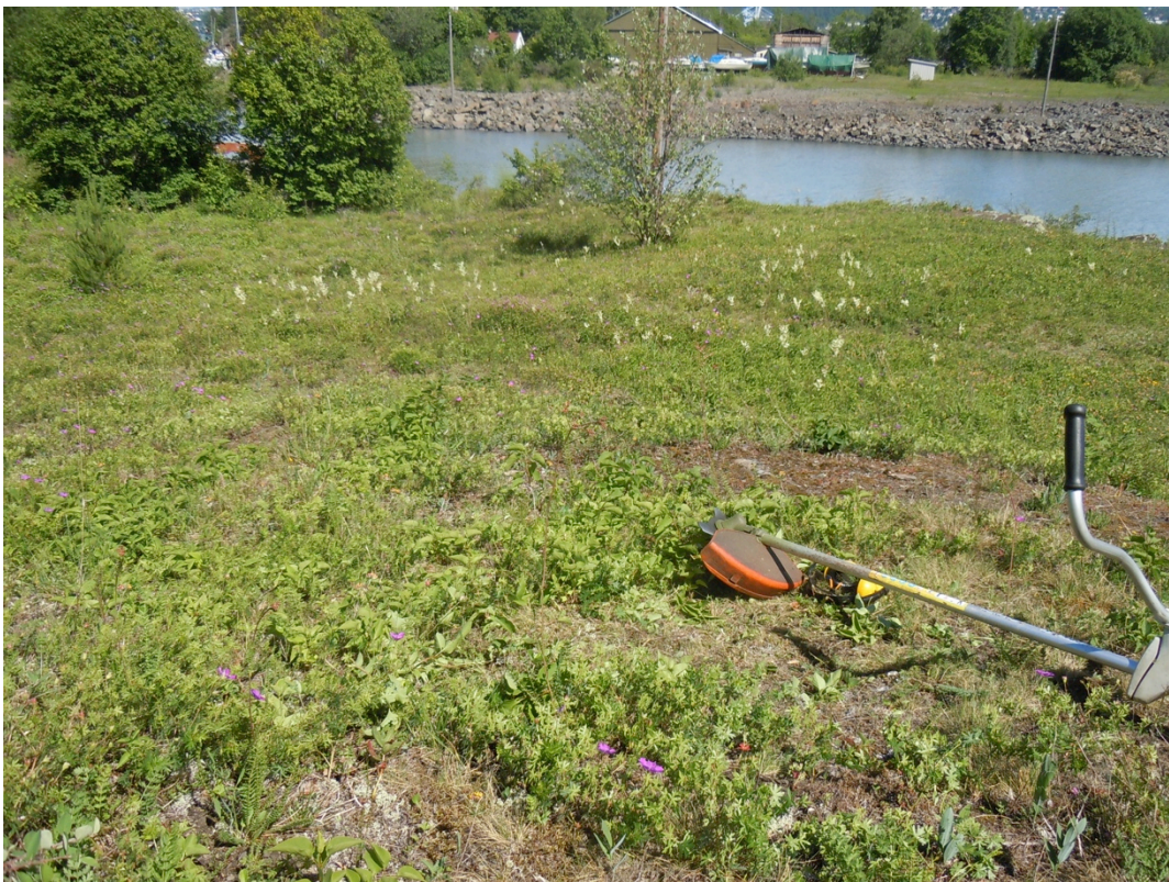
Photo 6. Selective cutting of Syrin shouts is fast and easy... 20.06.2022.