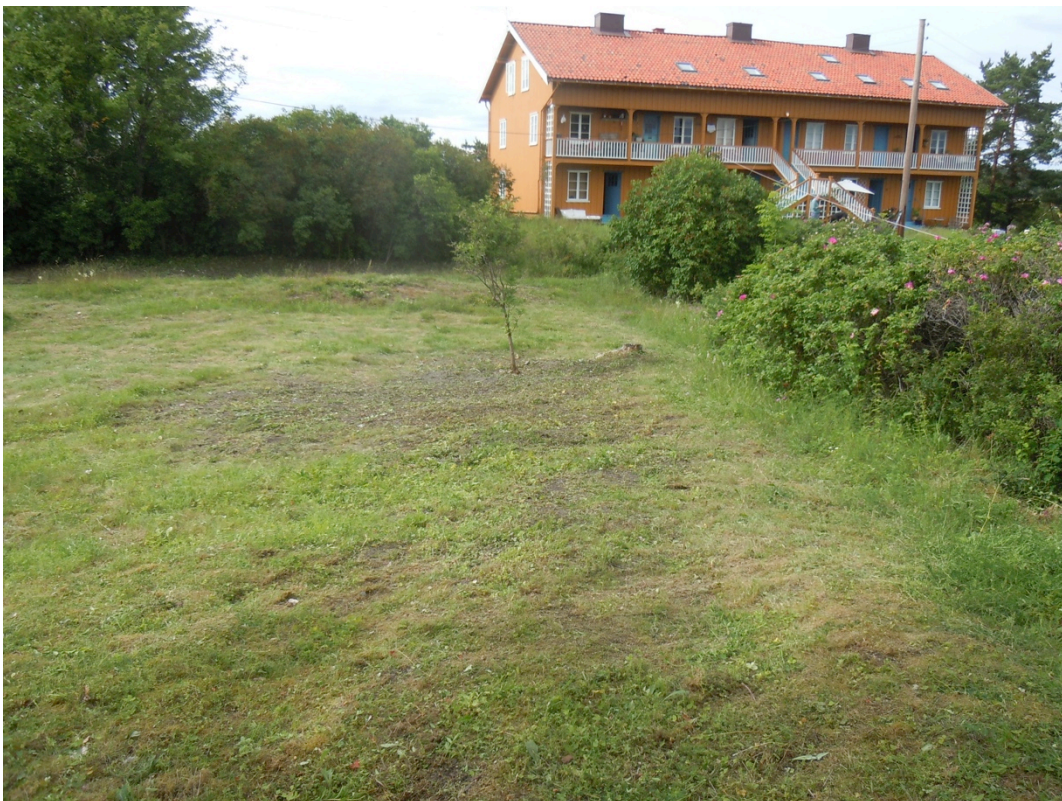
Photo 4. New shoots of Rynkerose were cut to the ground. 21.06.2022.