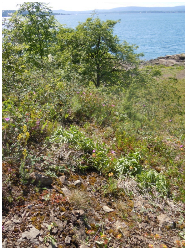
Photo 10. Removal of Russesvalerot from Dragehode site. 29.06.2022.