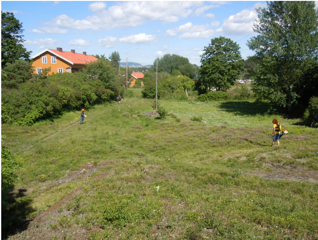
Photo 1. Beginning of mowing around a concrete circle with a pump (Mjødurt and Russesvalerot). 20.06.2022.