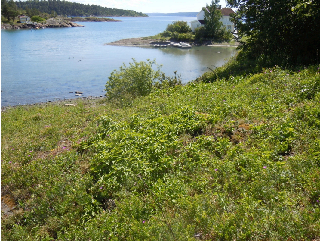
Photo 7. ... it do not kill syrin shouts completely... 20.06.2022.