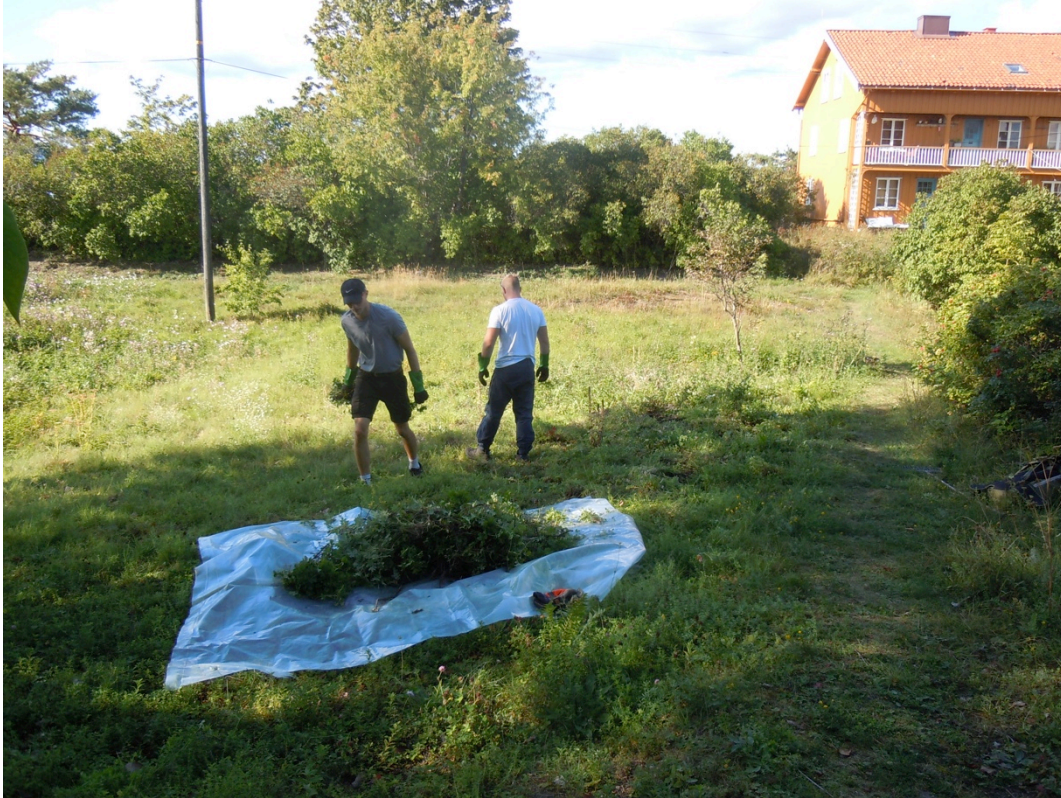
Photo 13. For the last time we drag up Rynkerose shoots instead of cutting them together with other plants. 6.09.2022.