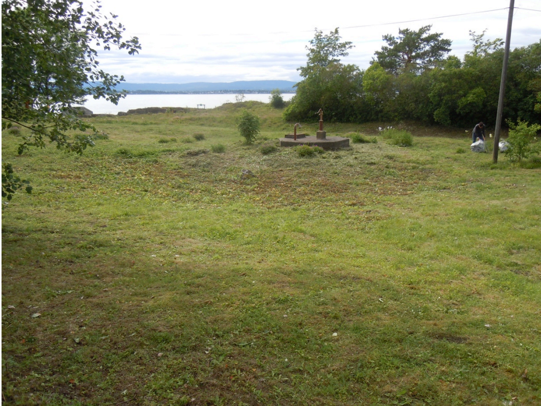
Photo 3. Most of the mown biomass has been deposited around the pump to cover and limit the growth of undesirable species such as Russesvalerot Vincetoxicum rossicum and Gravbergknapp Phedimus spurius . 21.06.2022.