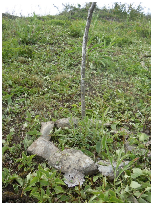
Photo 9. In one of that places I have even found new location of Dragehode. (is mark for not to cut it during our work). 21.06.2022.