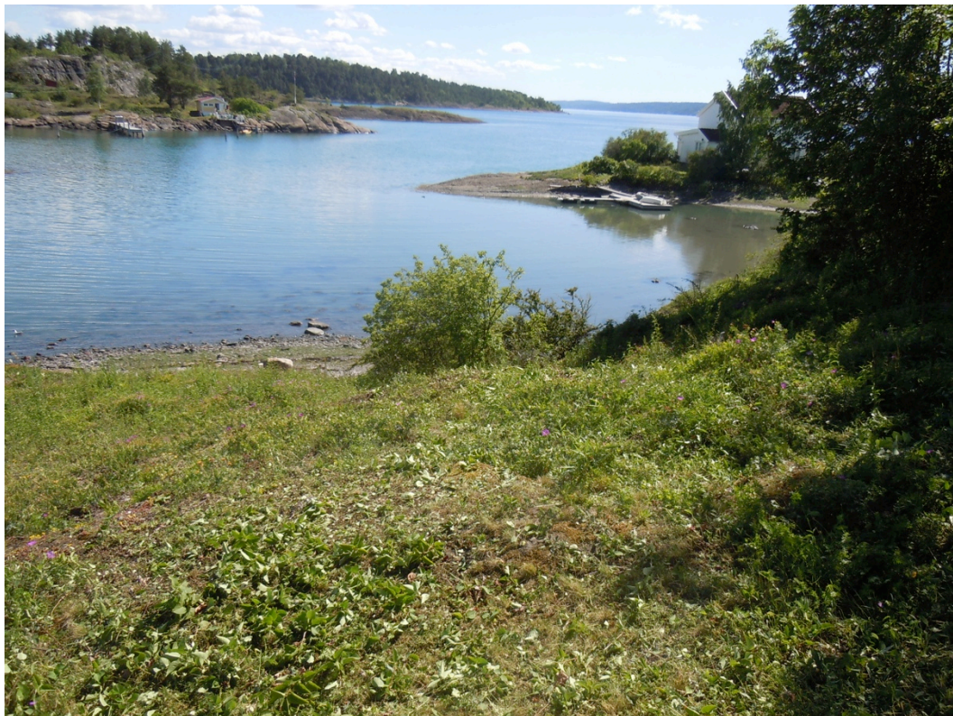
Photo 8. ... but weakens them and aloud other characteristic for this habitat vegetation to grow... 20.06.2022.