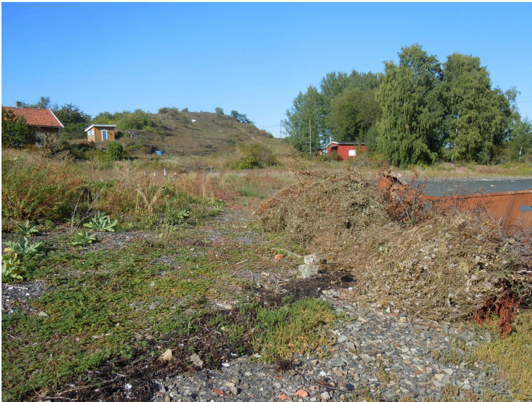
Photo 12. ... and a biomass collected to be burn. 1.09.2022.